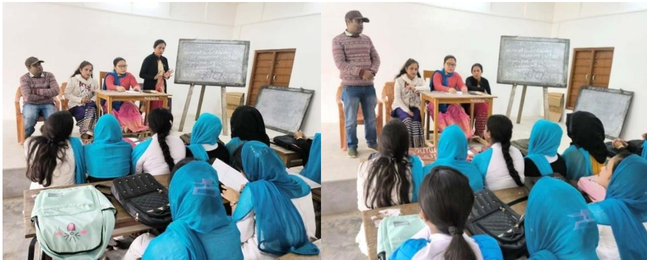
Principal MURAZAR COLLEGE P.O. Murazar Hojai (Assam)