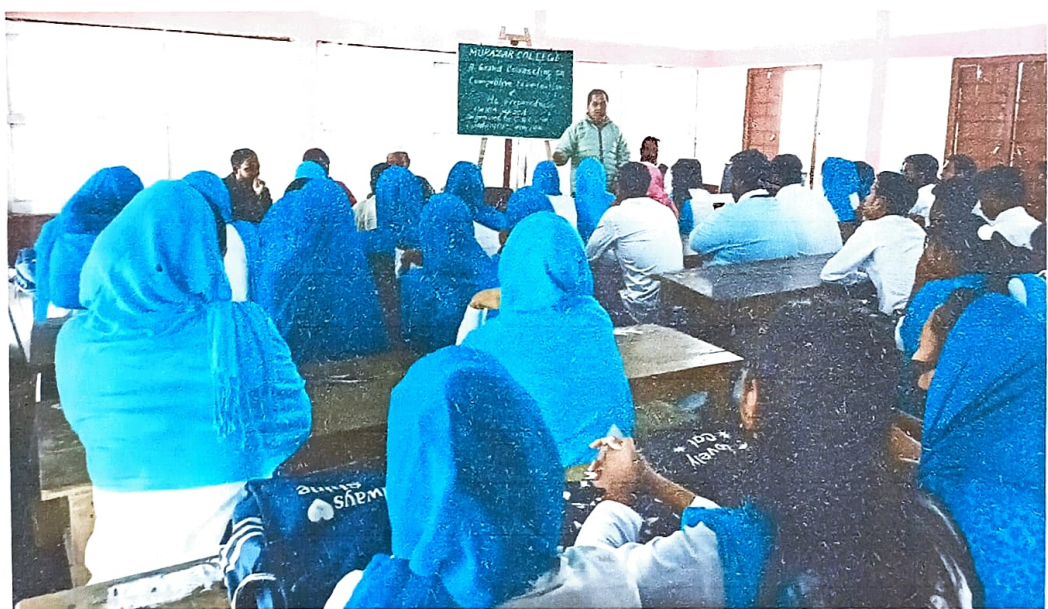
Principal MURAZAR COLLEGE P.O. Murazar Hojai (Assam)